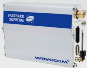
GSM Wavecom COM modem