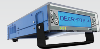
EXSA Decrypta 4 - phone card