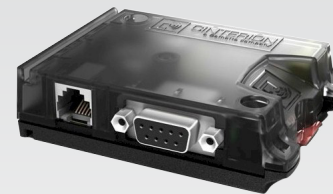
GSM Cinterion COM modem