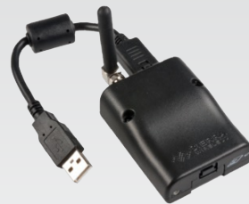
GSM Wavecom USB modem