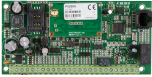
PX200N Universal GPRS/GSM communicator