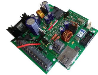
TwinCom Universal communicator